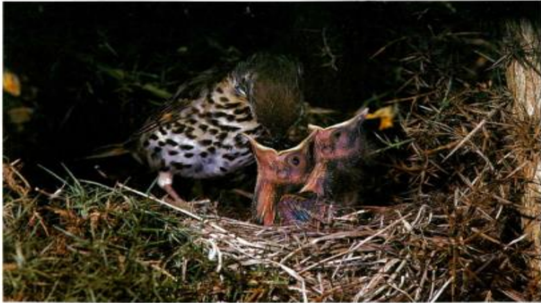
These song thrush baby birds are begging for food from their parents. They have brightly coloured mouths so that their parents can see them. They have small feathers.

Look at these song thrush chicks. They are born very helpless. They grow very quickly in the nest. When they hatch, song thrush baby birds have no feathers. Their eyes are not open.