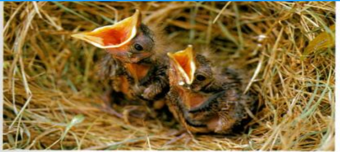
These nine-day-old song thrush baby birds are growing feathers.