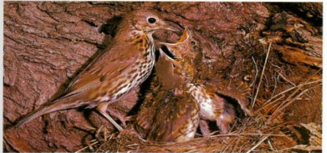
These thirteen-day-old song thrush baby birds are covered with feathers. They are fledged. The baby birds will leave the nest in the next five days.