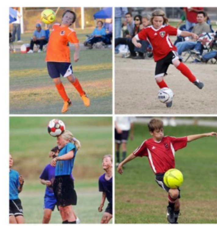
Instead of using hands, players use their chests, feet, heads, and legs.