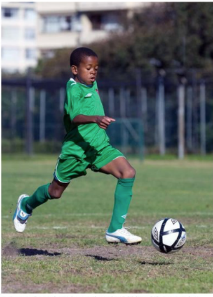
A player in the Under 11 league shows his dribbling skills in a match in Cape Town, South Africa.

Players run with the ball by dribbling it. They kick the ball to themselves with short, quick taps.