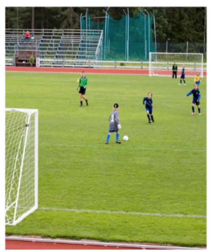
A soccer field, or "pitch," has a goal at each end.