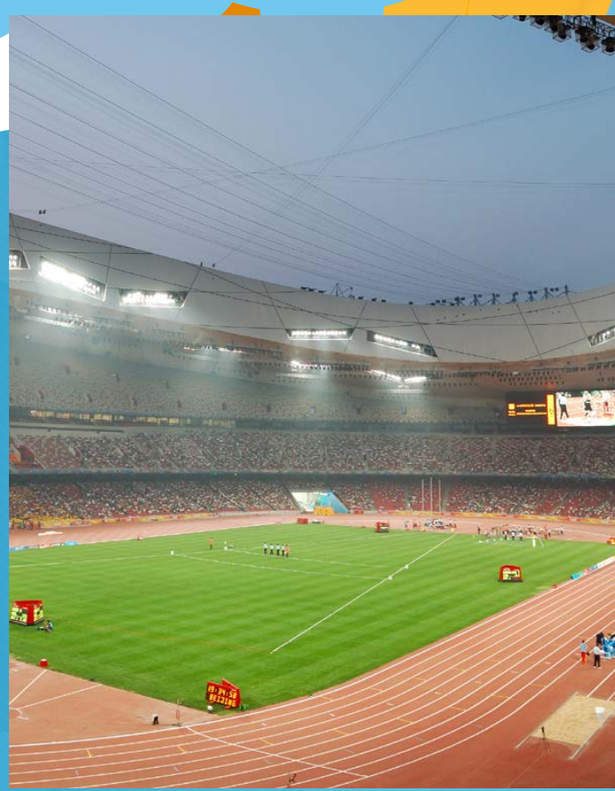
Many Olympic events take place on the track and field.