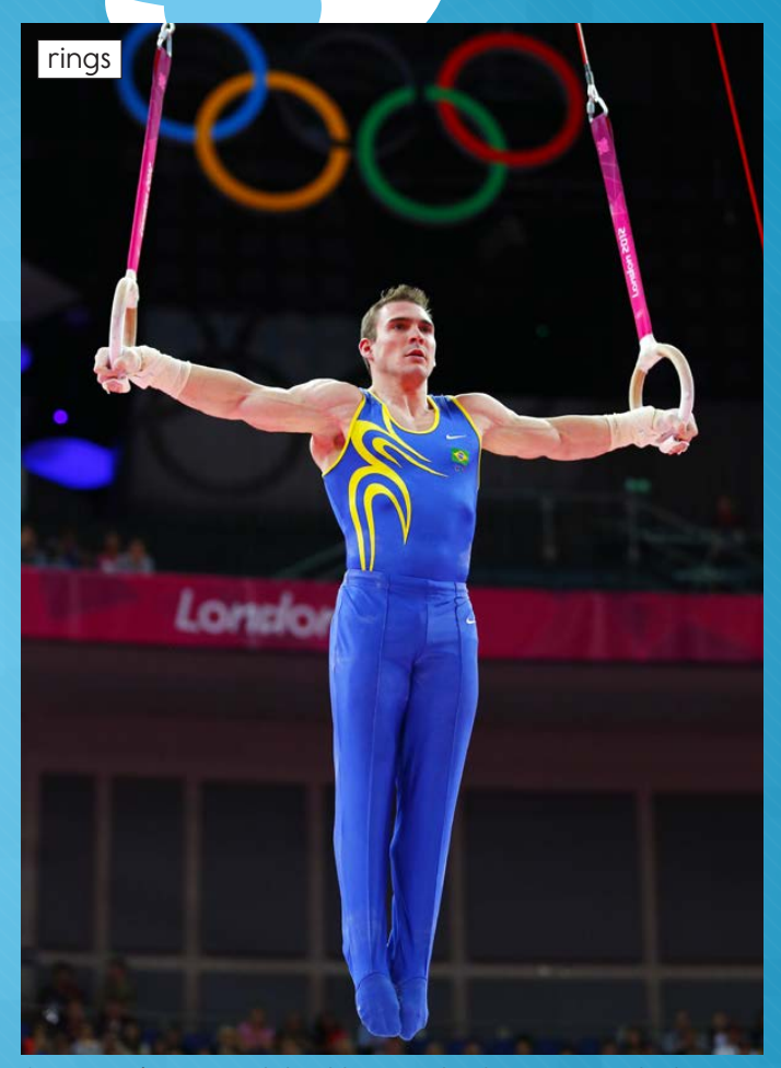
A gymnast's arms and shoulders need to be strong to do the rings.

Only women compete on the balance beam. They must balance on the beam while they turn and flip.