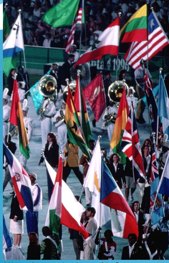
Athletes walk in a parade at the start of the Games.