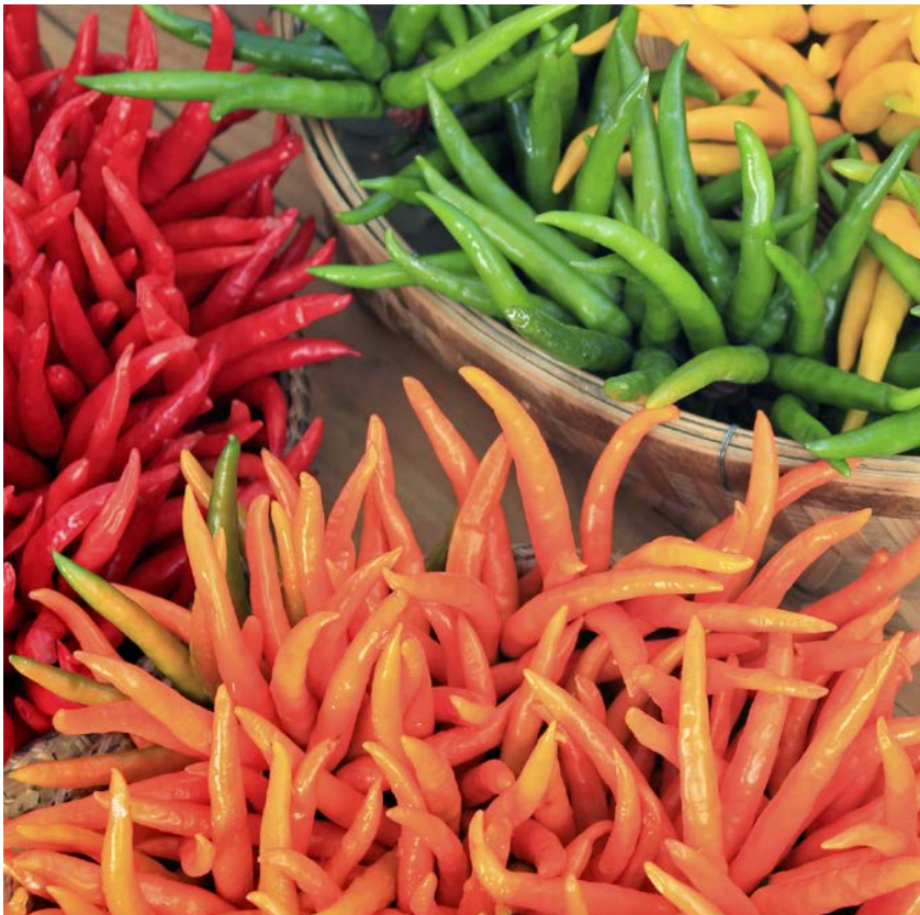
Peppers are used in many Mexican dishes.

Some peppers just make food taste different.