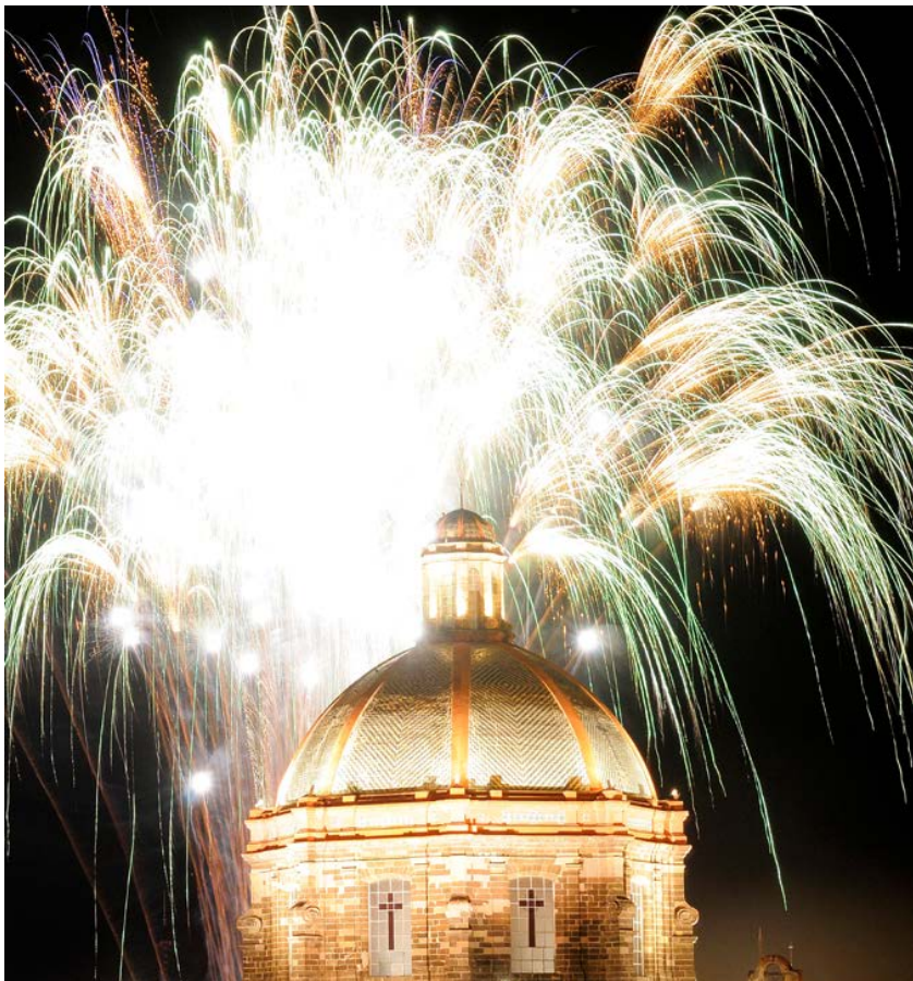
Fireworks are part of Mexican Independence Day celebrations.