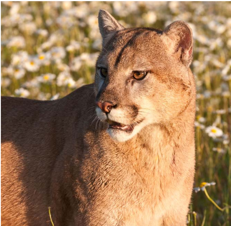
Mountain lions roam the deserts of Mexico.