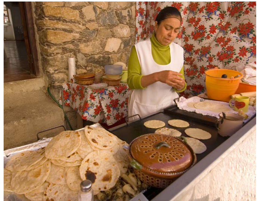
Mexicans use corn to make tortillas (tohr-TEE-uhz).