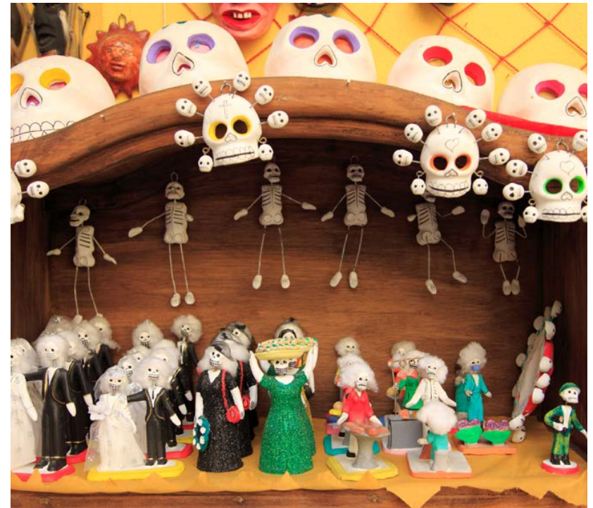
Toys for the Day of the Dead are skulls and skeletons.

Foxes, lizards, and other animals live in the hot, dry deserts.