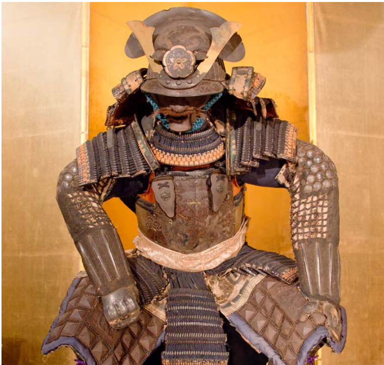
Samurai warriors in Japan wore armor to protect them.

In the past, Japan was an empire . It was ruled by emperors. Later, powerful military leaders called shoguns (SHOH-guns) took control away from the emperors. Samurai (SA-muh-rye) warriors also had power. The samurai were known as brave and skilled fighters.