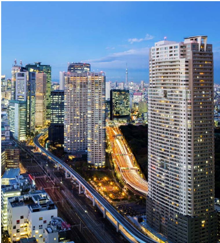
Tokyo is the largest city in Japan.

Tokyo (TOH-kee-yoh) is the capital city of Japan. It is on the largest island, called Honshu (HON-shoo). Tokyo has many tall skyscrapers . More than thirty-two million people live there.