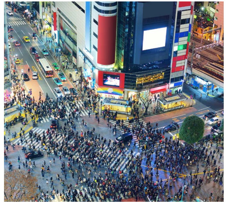
People cross one of Tokyo's busiest streets.

Tokyo (TOH-kee-yoh) is the capital city of Japan. It is on the largest island, called Honshu (HON-shoo). Tokyo has many tall skyscrapers . More than thirty-two million people live there.