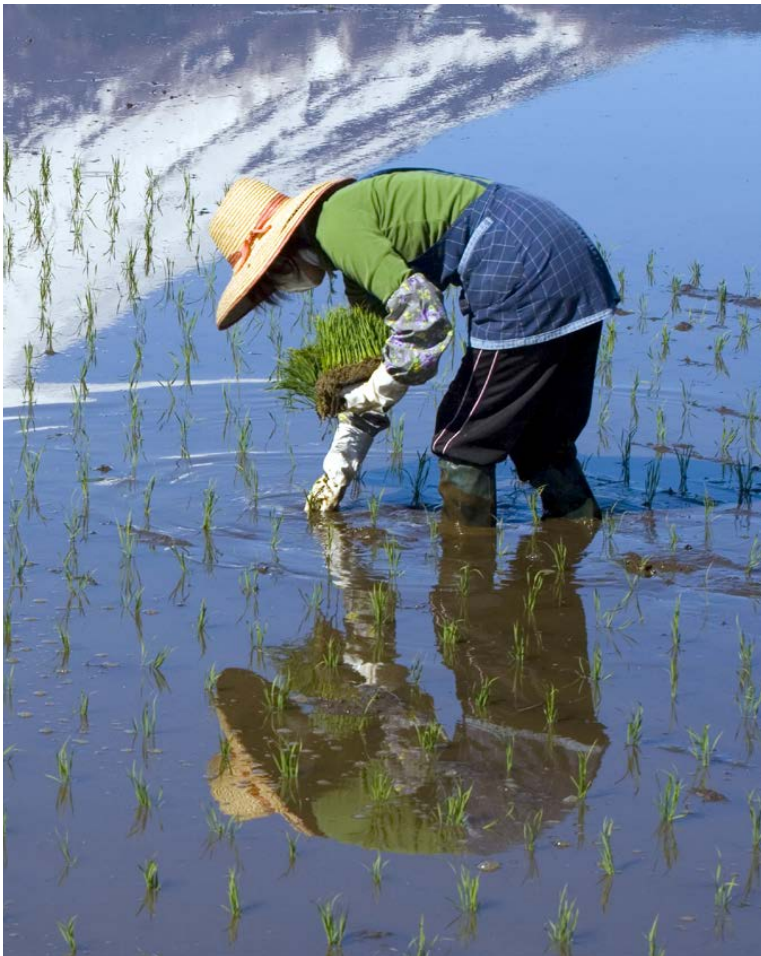
Farmers in Japan grow large amounts of rice in very little space.

Most people in Japan eat rice. Japan grows much of the rice it uses. The Japanese also catch many fish and sell them across the world.