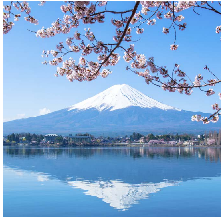
Mount Fuji is on the island of Honshu.

Most people in Japan eat rice. Japan grows much of the rice it uses. The Japanese also catch many fish and sell them across the world.