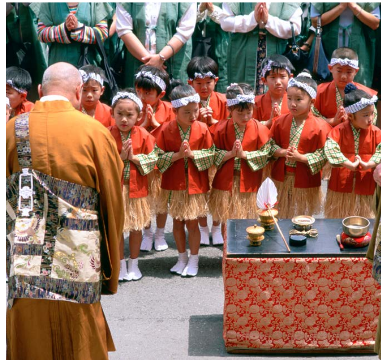
Children's Day in May celebrates the good health and happiness of children.

Rice is an important food in Japan. It is eaten at most meals. Noodles are also served with some meals. Another important food is fish. Japanese people sometimes eat raw fish called sushi (SOO-shee).