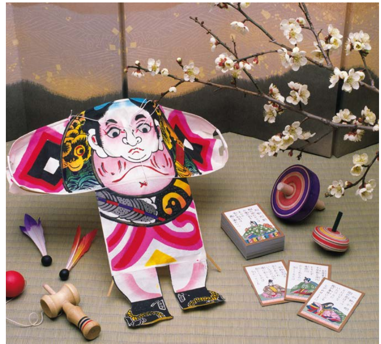
Children in Japan often get kites, spinning tops, and cards for New Year's.

In the past, Japan was an empire . It was ruled by emperors. Later, powerful military leaders called shoguns (SHOH-guns) took control away from the emperors. Samurai (SA-muh-rye) warriors also had power. The samurai were known as brave and skilled fighters.